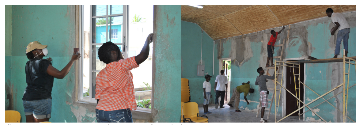
Church workers busy preparing the wall for painting