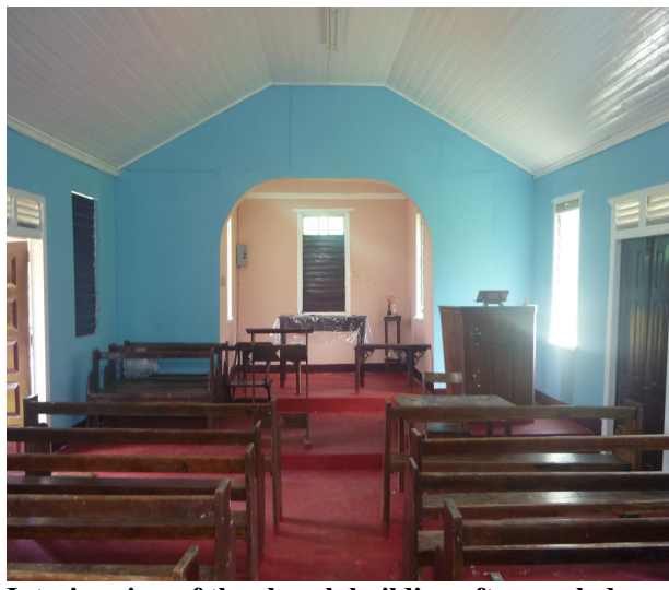
Interior view of the church building after work day