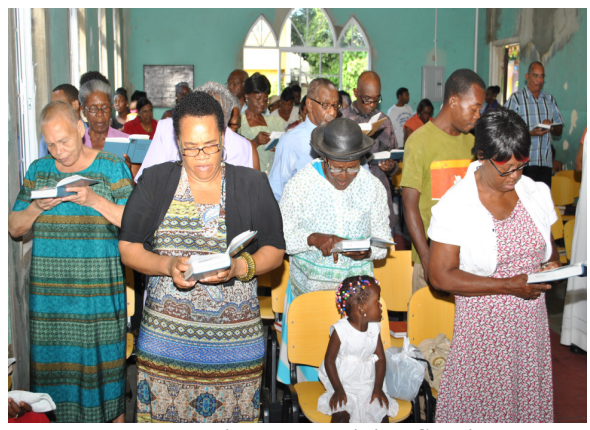
Members engaged in Thanksgiving Service