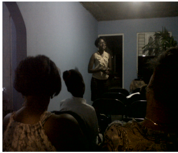
Alpha Course Participant April 2013