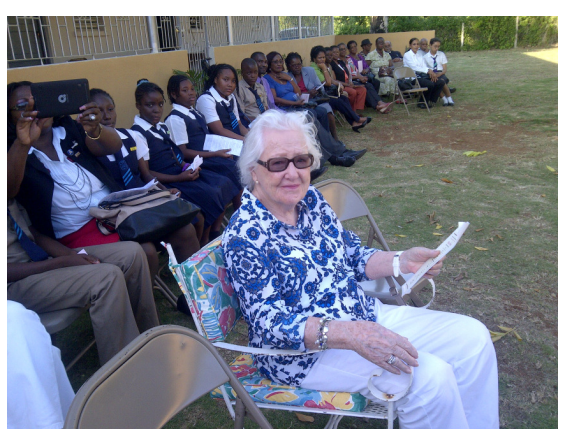
Children from Primary School entertaining the Residents at the Open Day of the Amy Muschette Home Open Day