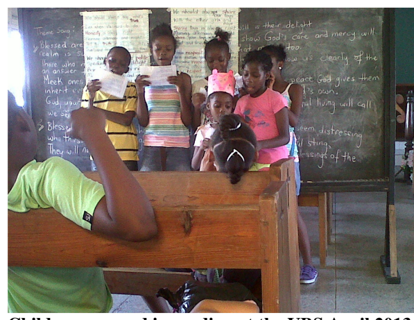
Children engaged in reading at the VBS April 2013