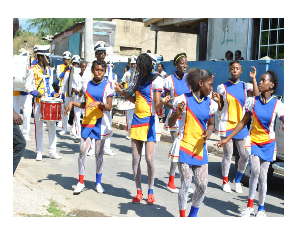
All Saints marching band performing at the end of the Service