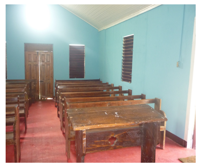
Interior view of the church building before work day