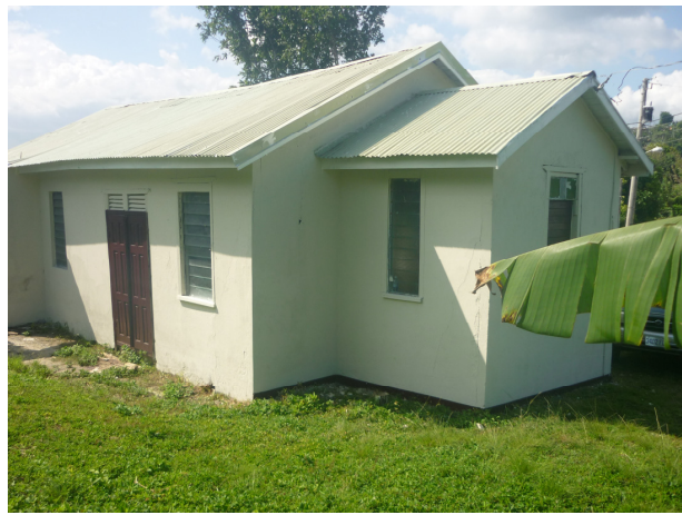
Complete Repairs to the roof of the church building