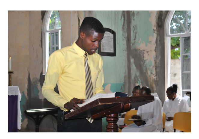
Reading of the lesson at the Church Service by a member of the All Saints Church