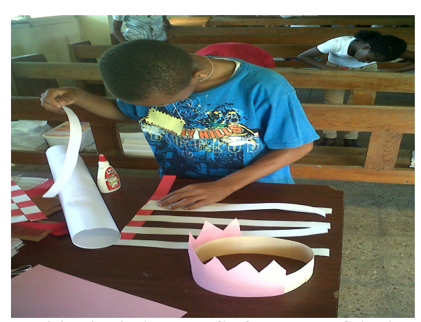
Participating in Arts and Crafts at the VBS April 2013